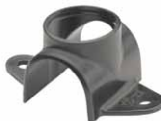
Drop Ear Bracket