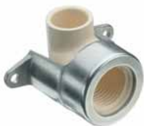
Drop Ear 90° Elbow