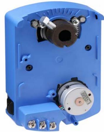
M9104-AGA-2N Electric Non-Spring-Return Actuator

For more information, refer to the M9104-AGx-2N Electric Non-Spring-Return Actuators Installation Instructions (Part No. 34-636-631) .