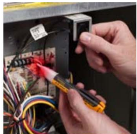
Low volt version

Fluke. Keeping your world up and running.®