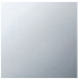
polished chrome 20 713 809-00 0010