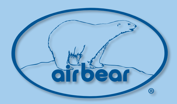
Another True Member of the Air Bear® Family