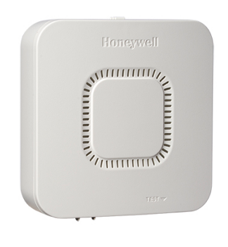
Water Leak Alert