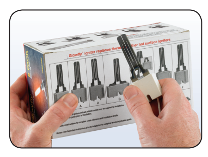
Match and mount simplicity.

Simply remove the old igniter and compare it with the diagrams on Glowfly's unique packaging guide to determine the correct mounting bracket for the job.