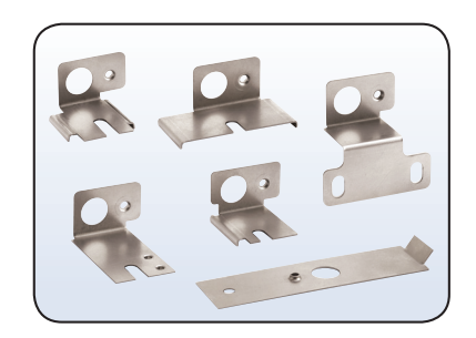
Six brackets. 110+ possibilities.

Simply remove the old igniter and compare it with the diagrams on Glowfly's unique packaging guide to determine the correct mounting bracket for the job.