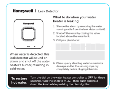
Homeowner Awareness Label