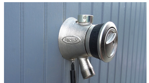
Step 6: Install remaining screw