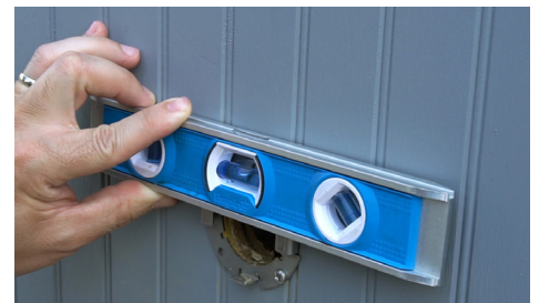
Step 4 cont’d: Ensure mounting bracket is level