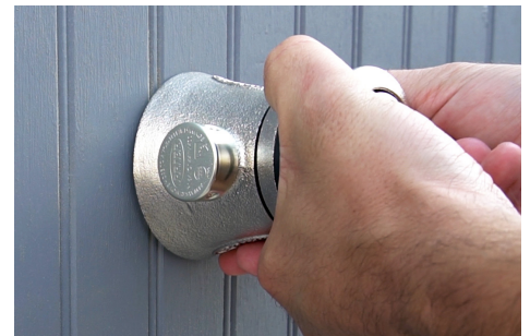
Step 5: Align spout and inlet with the half moon indents at 5 o’clock and 11 o’clock.