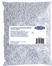
PROPPUMP-RK Refill #681740