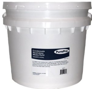
PROPP3.5GAL Refill #696879