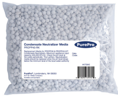
PROPP40-RK Refill #475942