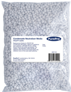
PROPP100RK Refill #681742