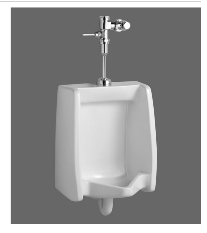
SEE REVERSE FOR ROUGHING-IN DIMENSIONS

• When installed so top of rim is 387mm (15-1/4") from finished floor.