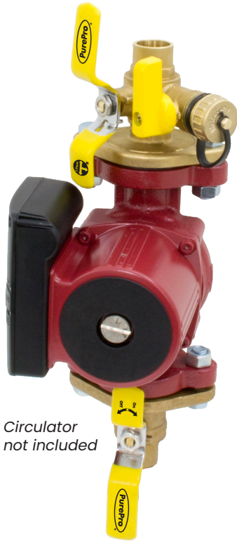
Circulator not included