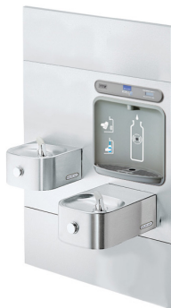
Shown with two optional access panels installed