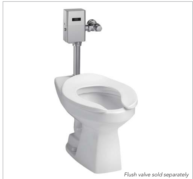
Flush valve sold separately