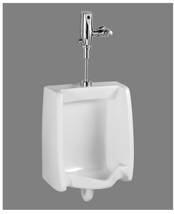
SEE REVERSE FOR ROUGHING-IN DIMENSIONS

ASME A112.19.2-2008/CSA B45.1-08 for Vitreous China Fixtures